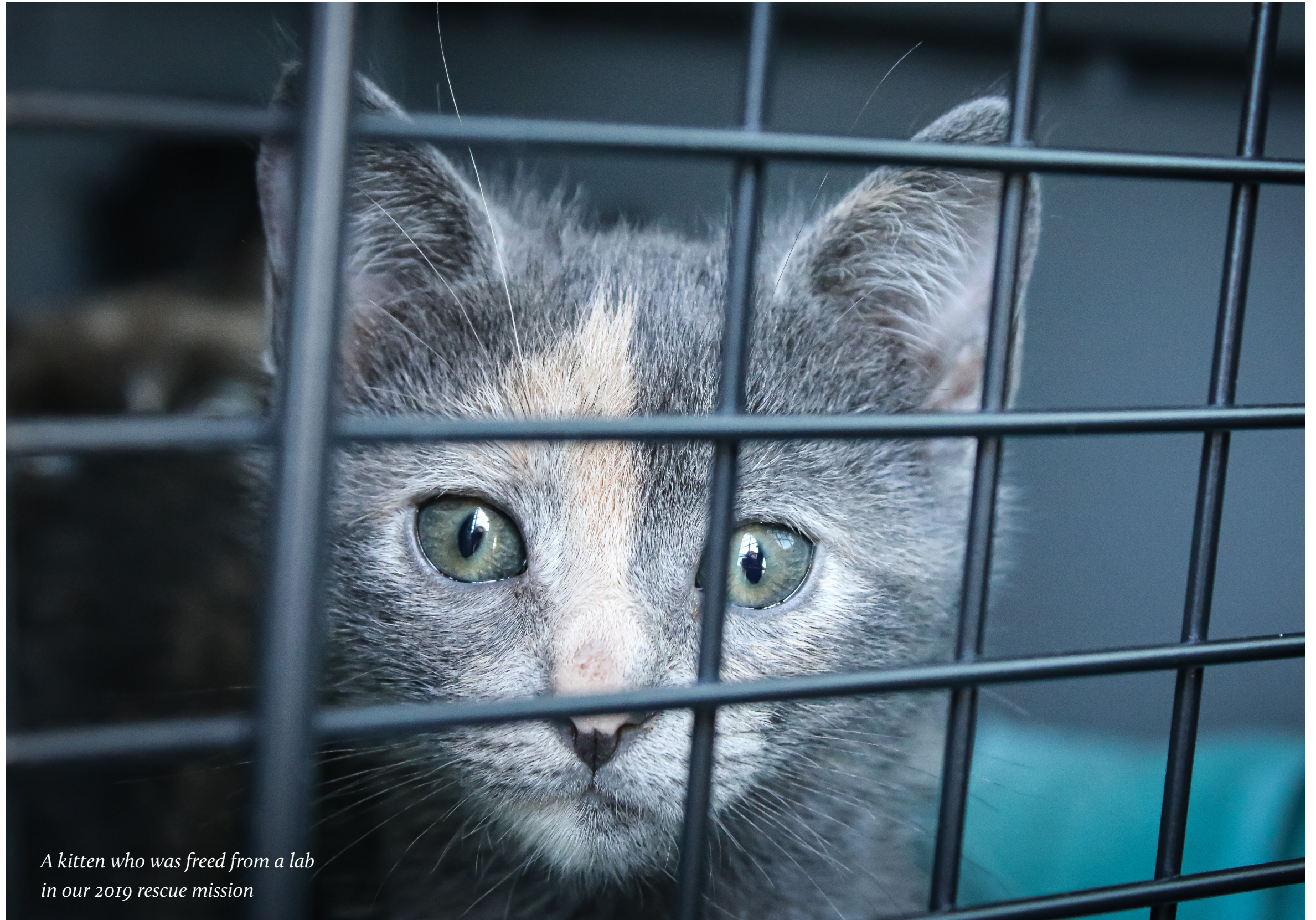
A kitten who was freed from a lab in our 2019 rescue mission