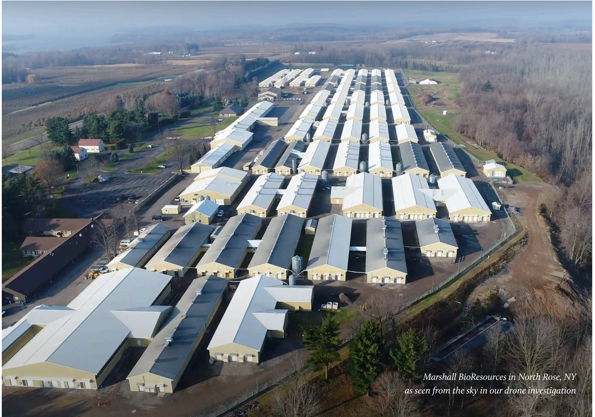
Marshall BioResources in North Rose, NY as seen from the sky in our drone investigation