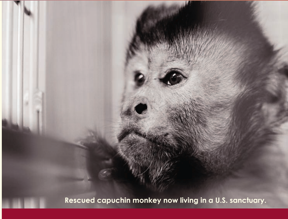
Rescued capuchin monkey now living in a U.S. sanctuary.

Increasing bipartisan co-sponsorship of the Humane Cosmetics Act in 2015 is deeply encouraging. But, we need to push it further by making sure every U.S. Representative is behind this bill. YOU can help move the HCA to passage by contacting your U.S. Rep. Ask him/her to help the U.S. follow the lead of numerous countries, which have already